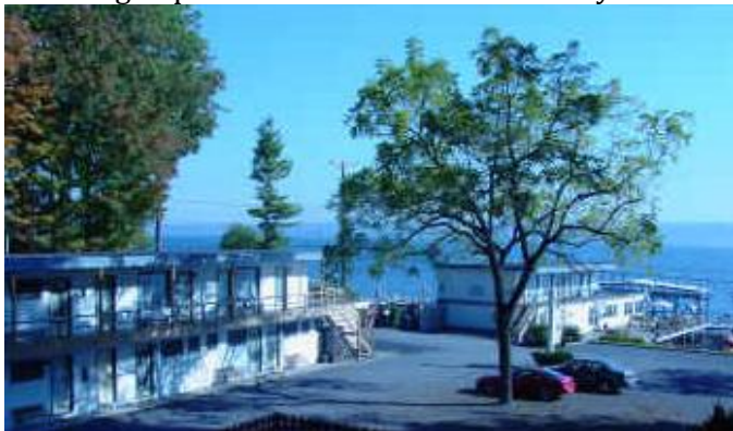
Showboat Motel with Restaurant canopy at the right in the background.